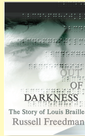
Out of Darkness: The Story of Louis Braille, Russell Freedman 1000L